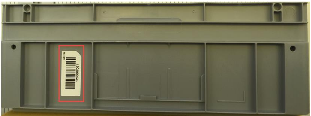
Figure 1: Gira bar code label

If the supplier attaches a label to reusable Gira packaging, it must be easily removable without tools and without leaving any residues. Gira reserves the right to invoice the sender for any costs involved in removing poorly detachable labels. The Gira bar codes on the reusable containers must not be removed, covered, or modified by any other means (see figure 1)!