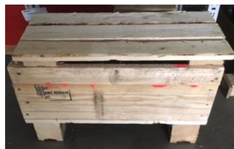
Figure 2: Wooden box IPPC standard 1